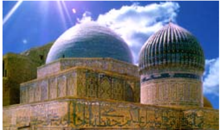
Hodja Ahmet Yassau mausoleum in Turkestan (South Kazakhstan) is a place with a special meaning for millions of Muslims around the world.

During Stalin’s purges in 1930s, the brightest and the best of the nation were repressed and often shot dead. Kazakhstan was home to many of camps of infamous GULAG camp system where millions of political prisoners were sent to.