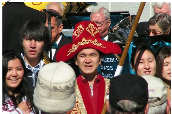
Kazakh students sing the national anthem in Tucson.