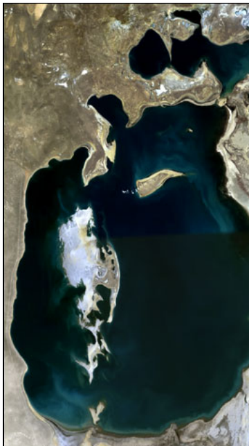
July - September, 1989

The dam is more than 13 kilometers long, its foundation will be 300 meters wide and its top will be 9 meters wide. Its height is 4 meters on average, and 10 meters above the former channel.